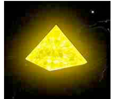
Artist's Conception of the New Jerusalem