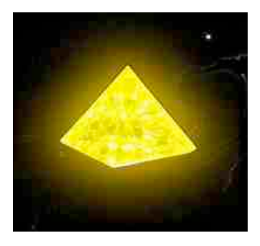
Artist's Conception of the New Jerusalem

And the street of the city was pure gold, like transparent glass.